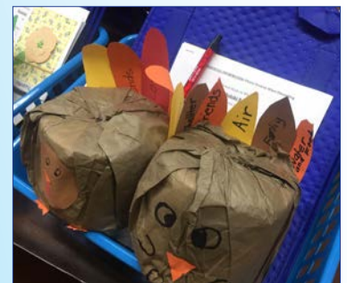
Our Thanksgiving Toilet Paper Turkeys made by Punahou School students.