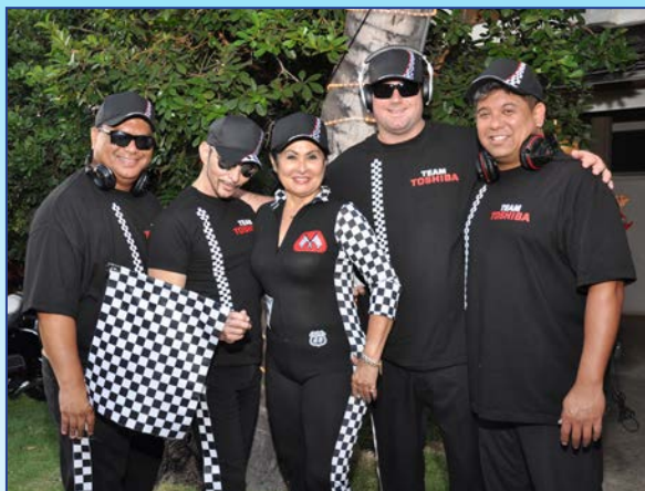
The 2016 Hot Wheels Gala Costume Contest Winner: Toshiba Business Solutions.