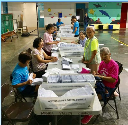
Monday Morning Mail Out ladies who label over 8,500 envelopes for our mailings.