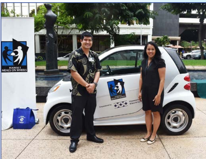
Mahalo to Hawaiian Electric and Aloha United Way for their donation of an electric car to Hawaii's Meals on Wheels.