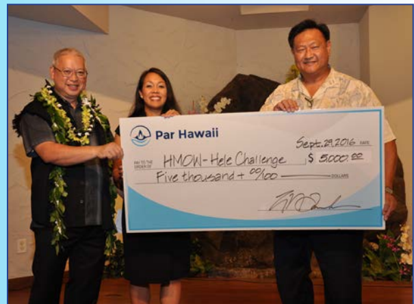
A $5,000 check from Par Hawaii for the Hele Matching Grant Challenge.